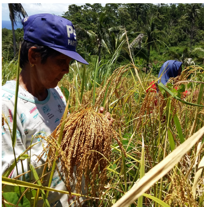
Six years after typhoon Bopha, community members of Barangay Ban-ao, Baganga, Davao Oriental continue to produce upland rice intercropped with coconut (left photo).

The reintroduction of heirloom or traditional rice varieties that was started in disaster recovery projects for Typhoon Bopha communities was enhanced in Haiyan-affected areas. Communities established trial farms to determine which traditional rice varieties would thrive most in local conditions. After several cycles, communities have already identified the suitable varieties and scaled up production. A seed bank was also established, ensuring that growing traditional rice varieties would be sustained.