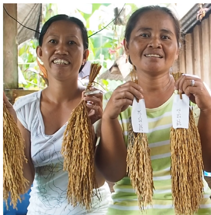
In Barangay Bayabas, Dagami municipality, located in the region most affected by typhoon Haiyan, members of a livelihood group have successfully established their trial farm, scaled up production and set up a seedbank.