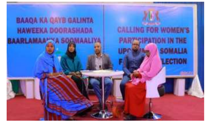
Dialogue Forum in Puntland, Somalia in December 2019.

The campaigns in all the countries included face-to-face community events and social media to advertise the events and widen the reach of the campaign in most countries. In <u>Burundi</u> and <u>Somalia</u>, the campaigns significantly relied on social media , whereas <u>Rwanda</u> used limited social media, and <u>Sudan's</u> campaign was entirely offline. Radio was also used as an important media channel in Rwanda, Burundi and Sudan.