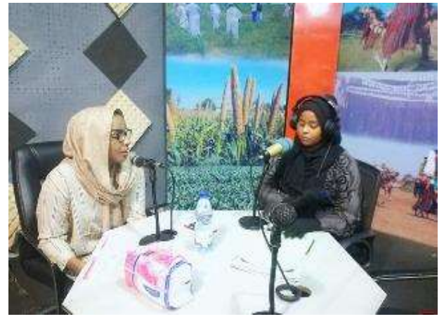
Interview with a psychologist on the impact of early marriage, East Darfur, Sudan

Radio became a new space for dialogue through interviews with women leaders and experts on gender and social norms in Burundi and Sudan. In Burundi, the radio shows featured women leaders of Village Savings Loans and Associations (VSLAs) who shared their experiences on leadership and women's political participation, and this helped expand the VSLA platform's influence by reaching out to a larger audience and raise awareness on women's participation and their election in the upcoming elections. In Sudan, the radio served as an accessible space for dialogue on controversial issues, like early marriage and FGM by interviewing gender experts, doctors, political leaders, and religious leaders. Discussing such sensitive issues impacting girls widens the space for dialogue on women's rights and their political participation in the future. By hearing messages about these topics on the radio, target audiences felt more informed about the topic; they were more willing to discuss it in their homes and communities and were more open to changing their perceptions as a result. Extensive anecdotal evidence has