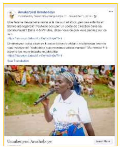
Post on Umukenyezi Arashoboye Facebook page for the campaign, Burundi. November, 2019

been reported of people discussing the topics more openly now in private and public spaces, such as households, in markets and community events, as a result of hearing discussions on the radio.