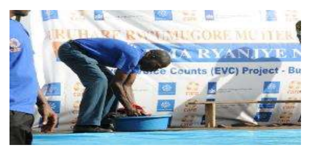
Role model from Nyanza District washes his family's clothes in Rwanda during a campaign event

changed their mind about women's participation in politics and began including their wives in decision-making about household finances. Similarly, the campaign in <u>Sudan</u> engaged with traditional and religious leaders who agreed to address negative social norms publicly (e.g., during sermons). These role models and powerholders have significant influence in their communities and can use their influence for a greater shift in attitudes among community members.