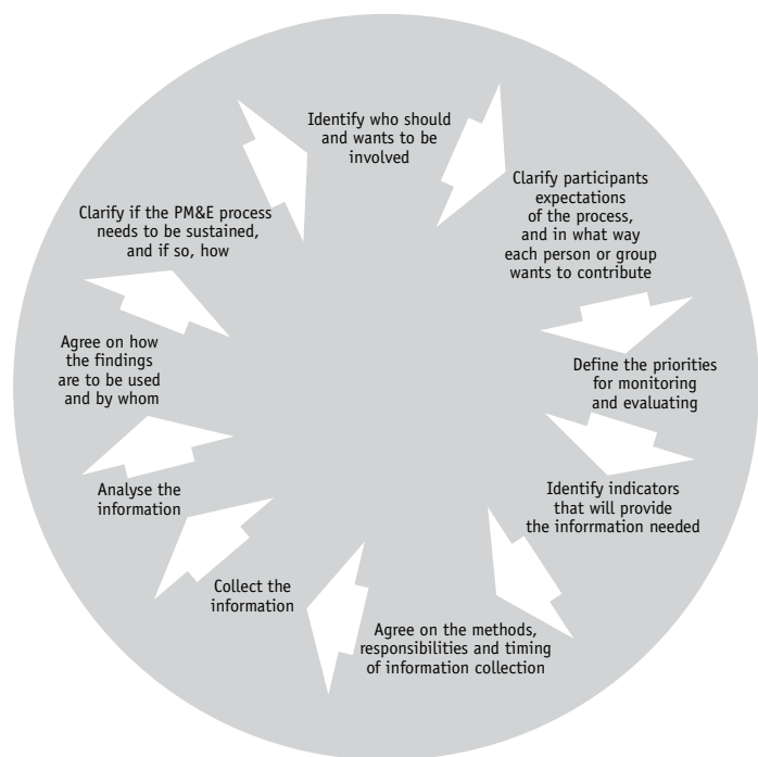
Figure 5: Scheme of sequence of steps in a PM&E process (Guijt and Gaventa, Participatory monitoring and Evaluation,1998)