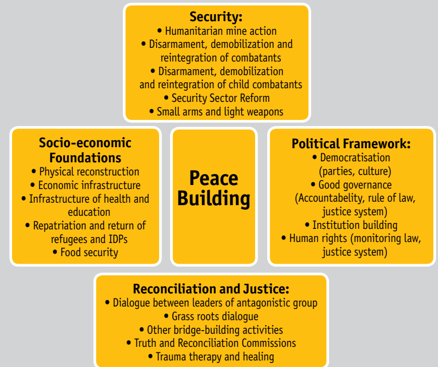
Figure 1: Utstein Peace building Palette (Smith, 2004)

The palette suggests 4 mayor categories of Peacebuilding interventions, which are each subdivided into various elements. The term "palette" is used here, because one of the interesting things about Peacebuilding "tools" is that they can be combined together in ways that are specific to the country, region and conflict in question, for greater effect – like